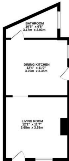
GROUND FLOOR 324 sq.ft. (30.1 sq.m.) approx.