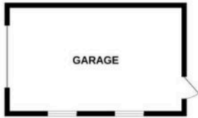
1ST FLOOR 403 sq.ft. (37.5 sq.m.) approx.