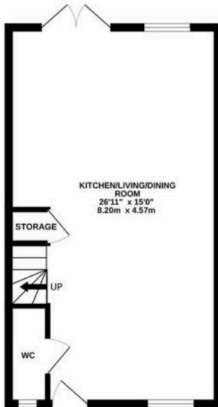
GROUND FLOOR 404 sq.ft. (37.5 sq.m.) approx.